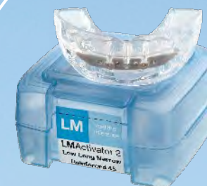
LM-Activator™ used by more than 1 million children worldwide