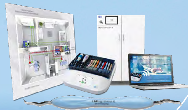
LM DTSTM, first tracking system for dental products