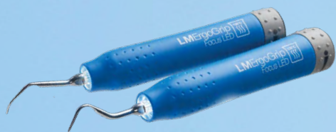
Ultrasonic scaler handpiece with LM-ErgoGrip™ silicone cover. First ultrasonic scaler handpiece with built-in LED light