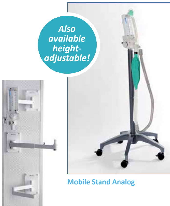
Mobile Stand Analog