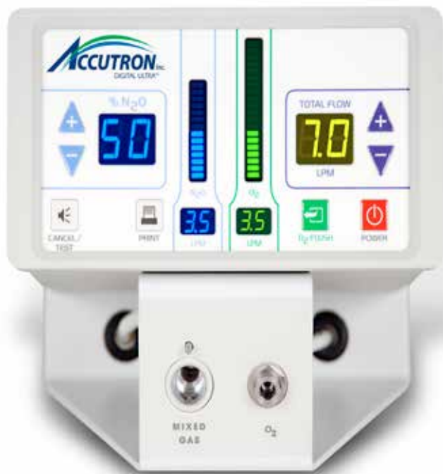
Digital Ultra™ Flexmount Flowmeter

GO DIGITAL: The Accutron Digital Ultra™ Flowmeter stands out with its visceral handling in a digital design. The Digital Ultra™ has an automatic flow regulation, which lets you adjust dosage and breathing volume in the easiest way possible.