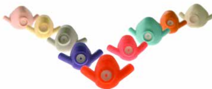
PIP+™ Nasal hoods in different scents and colours