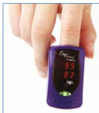
Onyx Vantage 9590, Art. No. NON9590