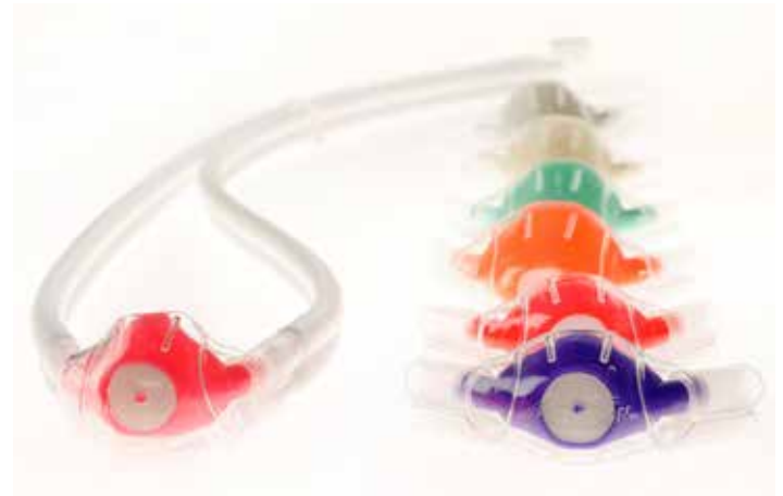
Scavenging circuit with sedaview® double masks Art. No. 43003

PLEASANT FOR DOCTOR AND PATIENT: The supple and flexible Accutron scavenging circuit guarantees greater comfort for you and your patient during the treatment. The hose system comes in an aesthetic white finish and the excellent quality of the individual components guarantee a safe working environment during the application of the gas mixture.