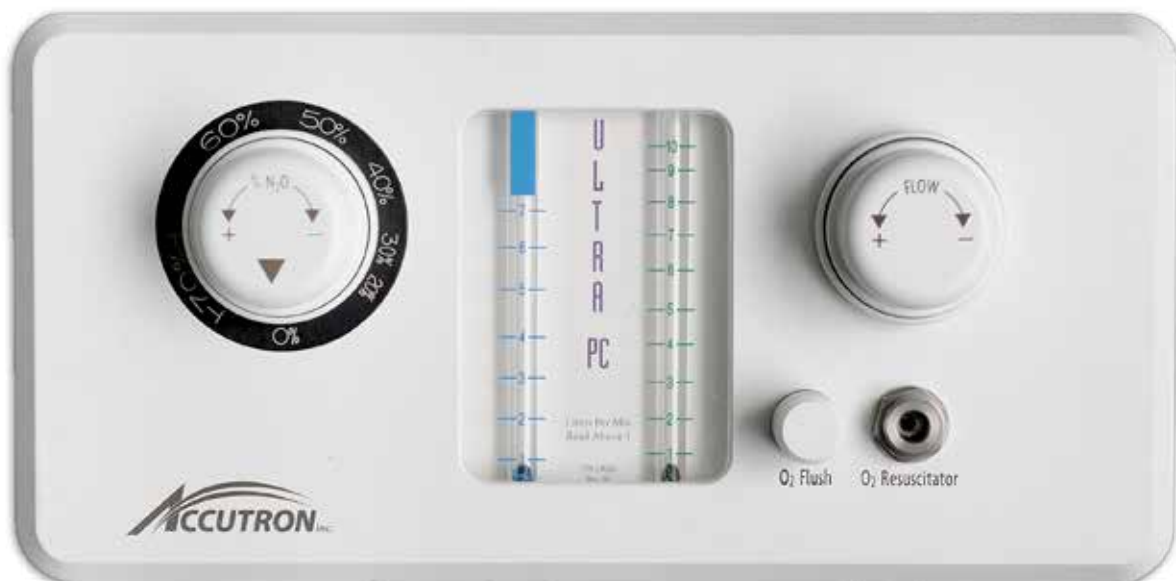
Ultra PC™ % Cabinet Mount Flowmeter