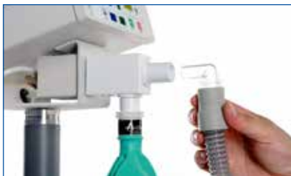
90° Bag tee adapter (Elbow) Art. No. 26255