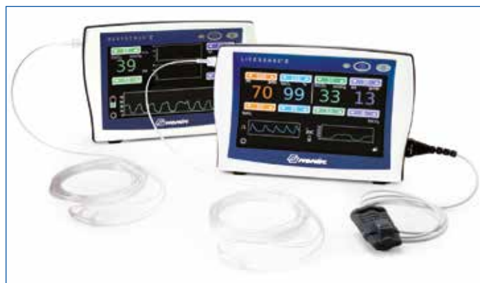
NONIN LifeSense II and NONIN RespSense II