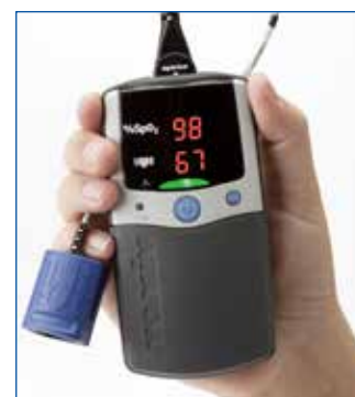
PalmSAT 2500A, Art. No. NON2500A