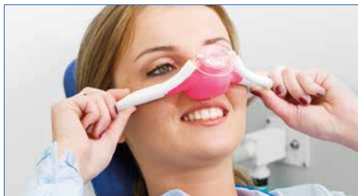
PIP+™ Nasal hood with scavenger hub

The Nasal hood is crucial for patient and user. A successful sedation with nitrous oxide puts high requirements on the mask and the scavenging circuit: Perfect fit, denseness and an optimal scavenging.