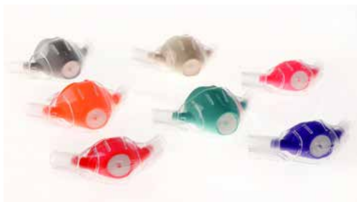
sedaview® masks in different scents and colours