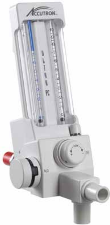
Ultra PC™ % Flowmeter

ATTRACTIVE BENEFITS FOR YOU CLINIC: Durable and self-powered units that are distinguished by their ease of use and decades of proven reliability. In their clean white finish, the analog Flowmeters present an aesthetic and modern look. You can also benefit from a fast return on the moderate purchasing cost of the analog Flowmeters.