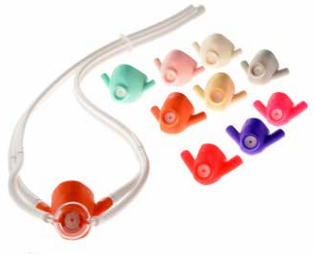
Scavenging circuit with PIP+™ nasal hoods Art. No. 32007