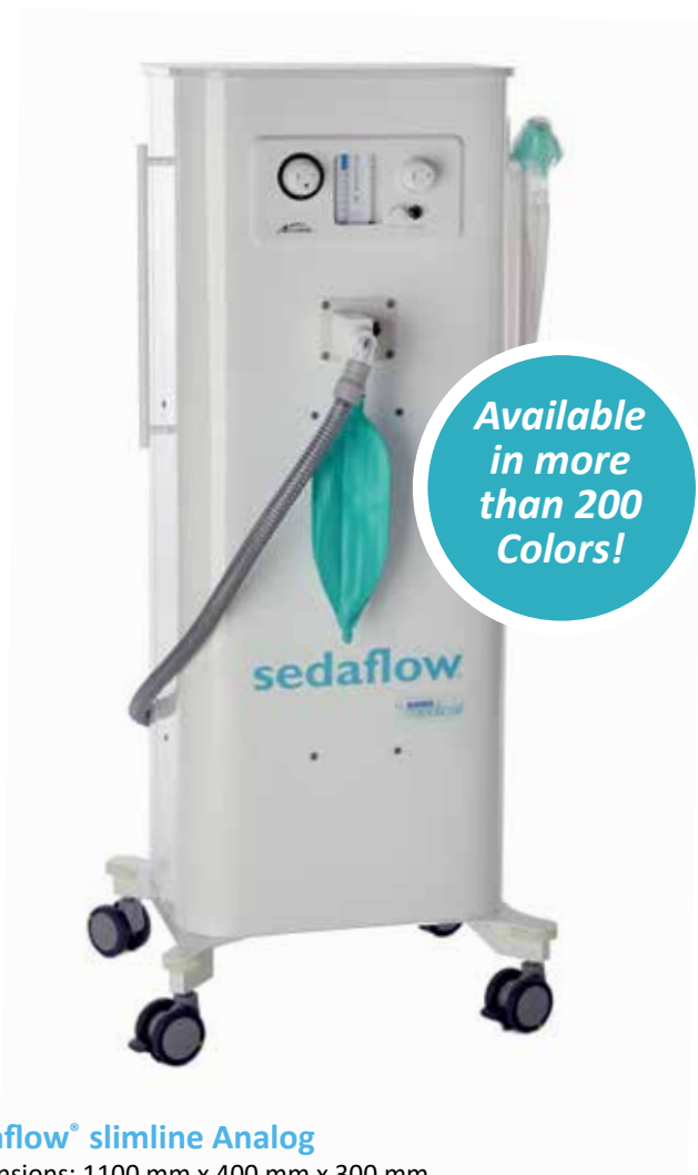
sedaflow® slimline Analog Dimensions: 1100 mm x 400 mm x 300 mm

TIPP: Solid wall construction with swiveling joint-wall arm or telescoping wall arm, fitting for all Accutron Flowmeter.