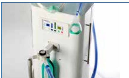
Y-Directional Valve Art. No. 47050

ACCESSORIES: ITS ABOUT QUALITY AND FAST DELIVERY: The flexibility and material quality of the scavenging circuit are crucial for the medic. Various accessories and a fast delivery of replacement parts optimize the application of N2O-sedation.