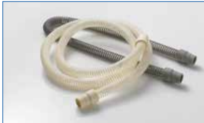
Scavenging circuit extension hoses