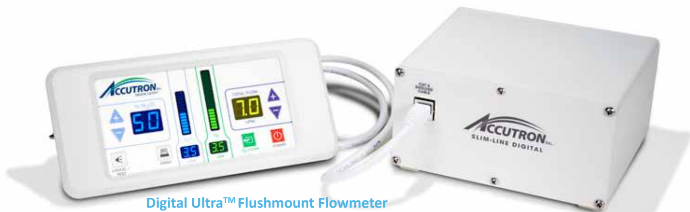
Digital Ultra™ Flushmount Flowmeter