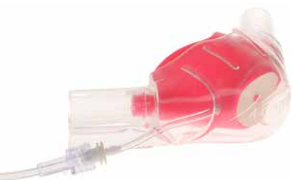
sedaview® CO2 Mask