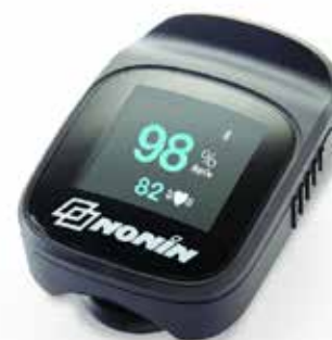
Nonin Connect, Art. No. NON3230