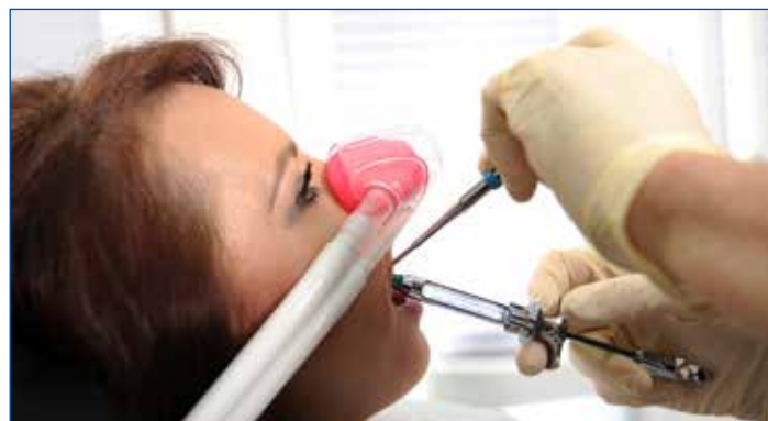
sedaview® doublemask with maximum working space