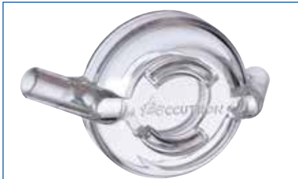
Scavenger Hub Art. No. 22099