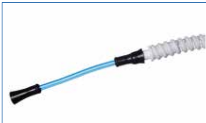
Adaptor for suction