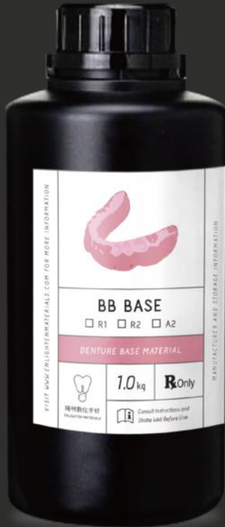
BB Base denture base