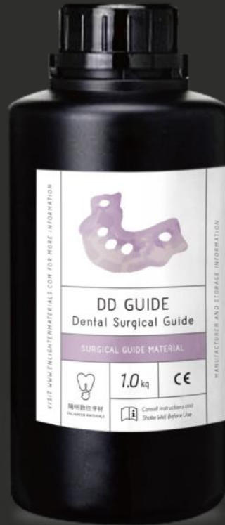
DD Guide dental surgical guide