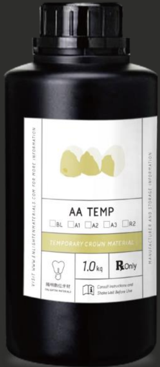
AA Temp Temp Crown and Bridge