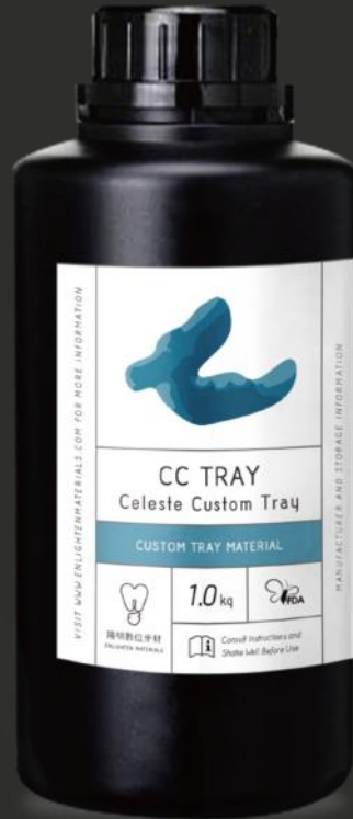
CC Tray custom tray