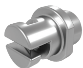
TWIST-LOCK PIVOT Slot Size .022