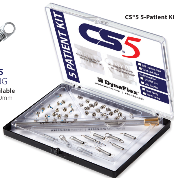
CS ® 5 5-Patient Kit

Important Note: Any previous CS ® Systems (CS ® 200 and CS ® 3) must not be intermixed with new CS ® 5 parts.