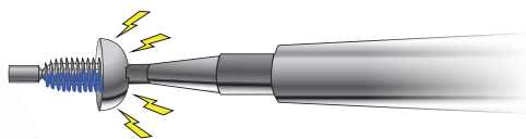
HYBRID SCREW WITH NYLOK™