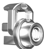
SELF-LIGATING PIVOT Slot Size .022