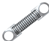
CS ® 5 SPRING Sizes Available 7mm & 10mm