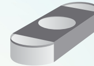
Three pack 3 x 100 g

Each package used by DIAVENA is certified to the highest quality standards and has a guarantee for safe use in foods.