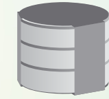
Three pack 3 x 160 g