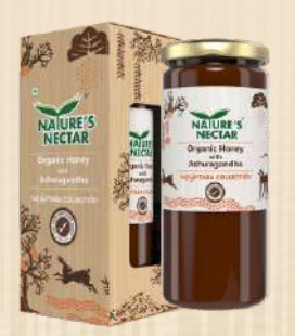
Pack Size: 325gm

This concoction comes with antiviral and antibacterial properties. It improves blood circulation while reducing stress, depression, anxiety and weight. This honey has an exotic taste and aroma.