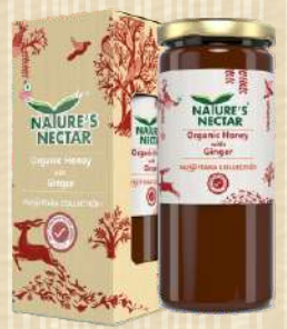
Pack Size: 325gm

This Concoction helps in reducing stress, anxiety, insomnia and weight while enhancing concentration and energy levels.