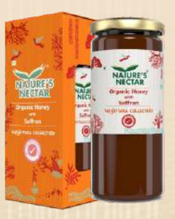
Pack Size: 325gm