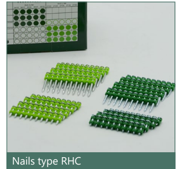
Nails type RHC