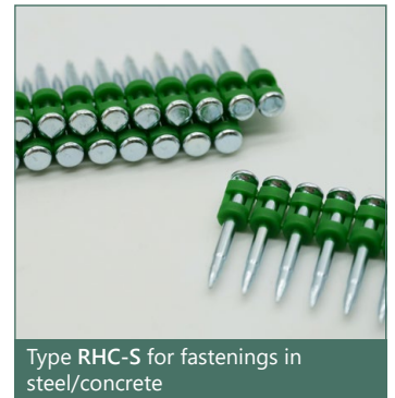
Type RHC-S for fastenings in steel/concrete