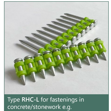
Type RHC-L for fastenings in concrete/stonework e.g.