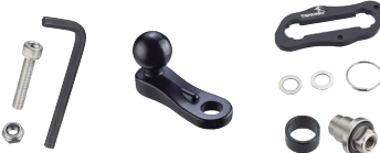
T-ATS01 T-BM07 T-ATS05