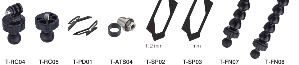
T-RC04 T-RC05 T-PD01 T-ATS04 T-SP02 T-SP03 T-FN07 T-FN08