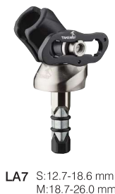
LA7 S:12.7-18.6 mm M:18.7-26.0 mm