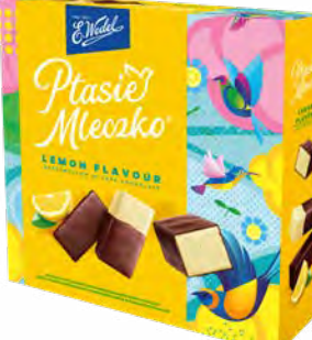
PTASIE MLECZKO® LEMON 340 G