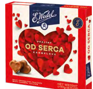
MILK CHOCOLATES WITH MILK FILLING & CARAMEL FLAKES 117 G