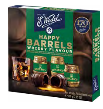
HAPPY BARRELS WHISKY 200 G