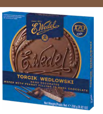
TORCIK WEDLOWSKI - HAND DECORATED WAFER 250 G