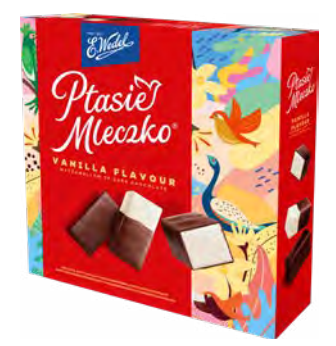
PTASIE MLECZKO® VANILLA 340 G