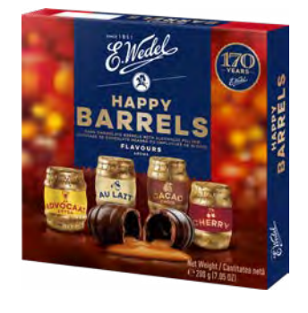
HAPPY BARRELS CLASSIC 200 G