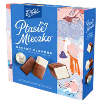
PTASIE MLECZKO® CREAMY 340 G