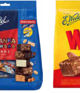
DARK CHOCOLATE COVERED CANDIES 356 G