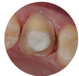
Traxodent rinses away easily