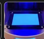
Uniform light irradiation High-quality print