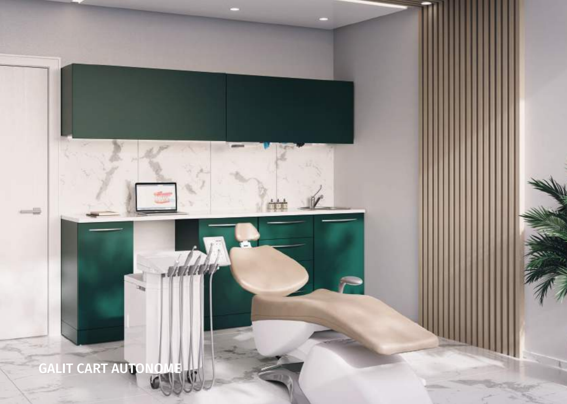
GALIT CART AUTONOME