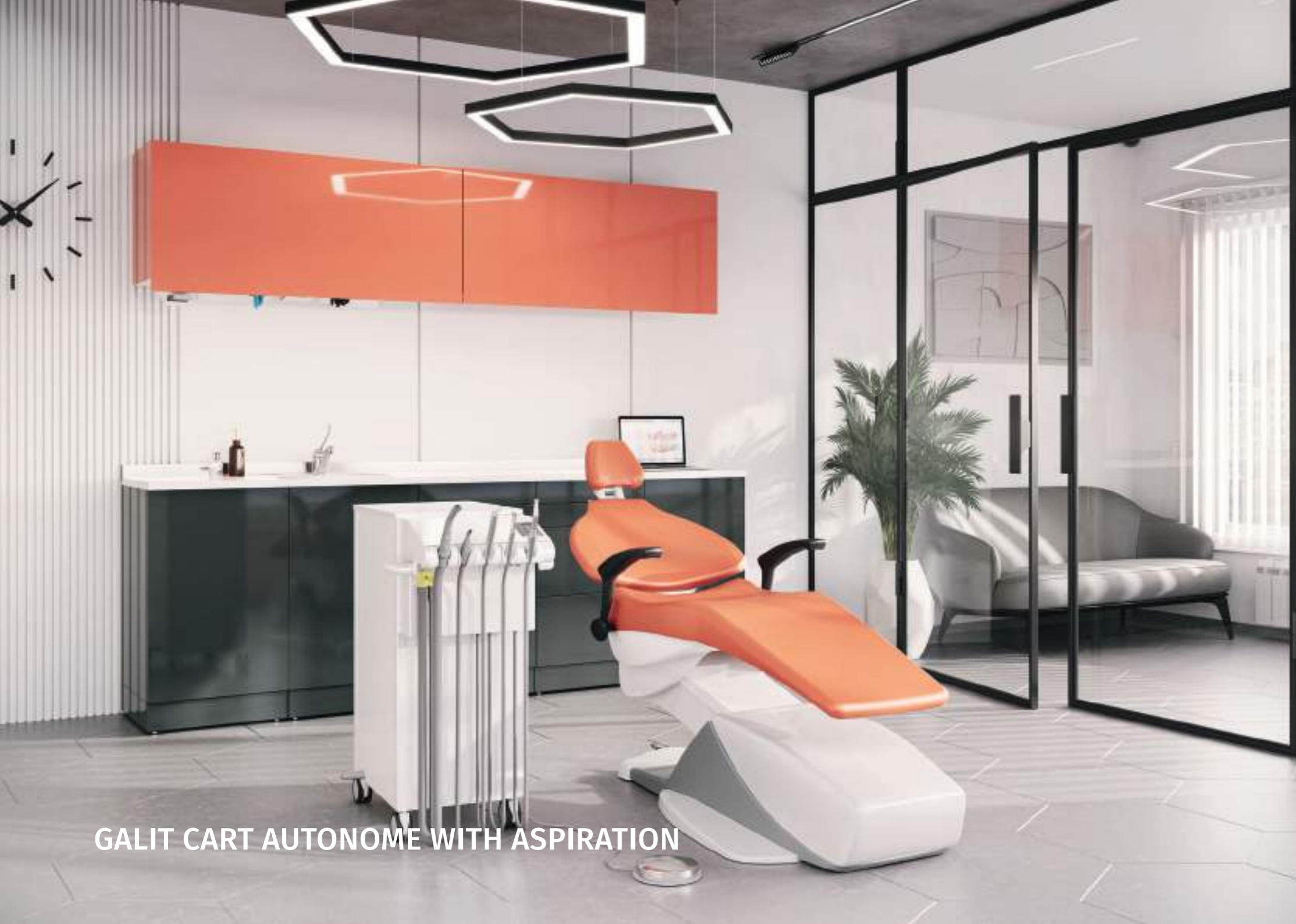
GALIT CART AUTONOME WITH ASPIRATION