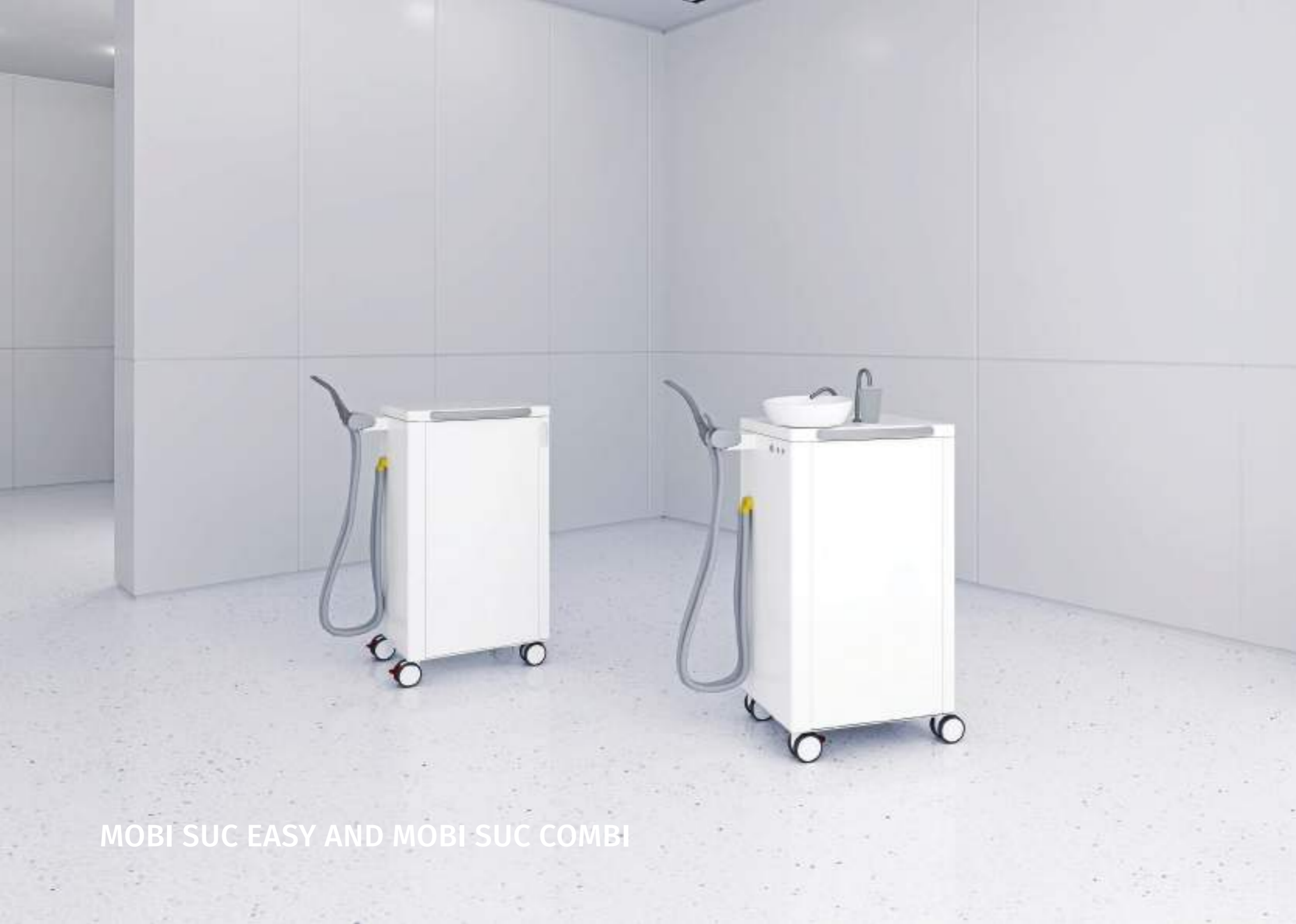
MOBI SUC EASY AND MOBI SUC COMBI