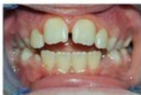
8 years old baseline condition