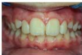
6 months after