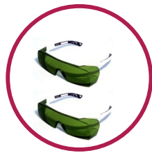
2 PAIA DI OCCHIALI