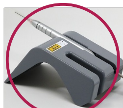
PORTA MANIPOLO ESTRAIBILE