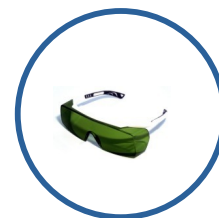
1 PAIO DI OCCHIALI