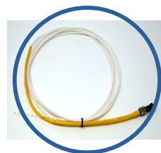
FIBRA ENDODONZIA DA 200