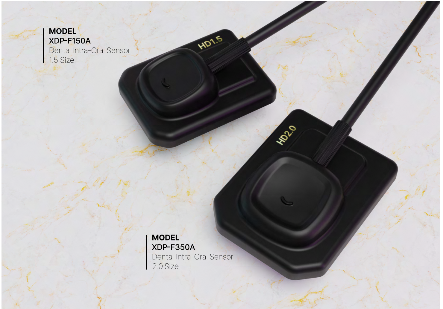
MODEL XDP-F150A Dental Intra-Oral Sensor 1.5 Size