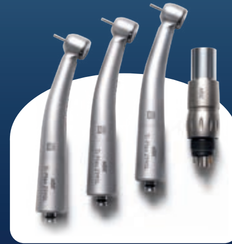
NSK's Ti-Max Z990L High-Speed Air-Driven Handpiece Bundle Shown.