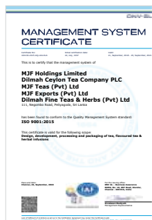
ISO 9001:2015 Quality Management System Certification