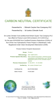
Carbon Neutral Product Certification