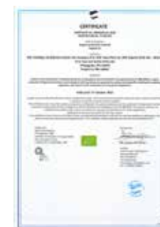
Organic Certification to Regulation (EC) No 834/2007 and Regulation (EC) No 889/2008