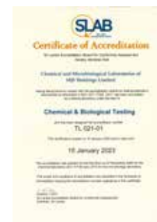
ISO:17025 Chemical and Microbiology Laboratory Certificate of Accreditation