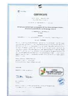
NON-GMO Production Standard