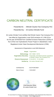
Carbon Neutral Facility Certification