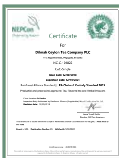
Rain Forest Alliance Certification