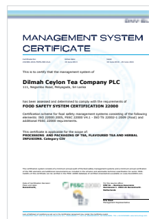
FSSC 22000 - Food Safety System Certification