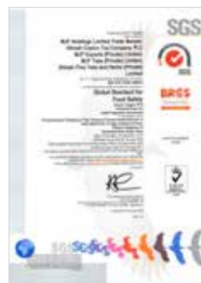
BRC Global Standard for Food Safety