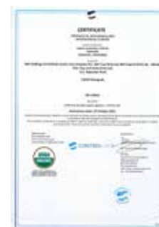
Organic Certification to USDA, AMS 7 CFR Part 205 , National Organic Program