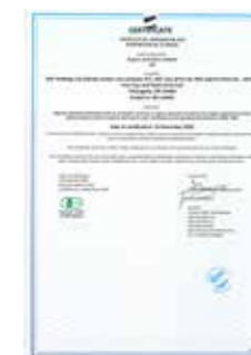
Organic Certification to Japanese Agricultural Standard of Organic Agricultural Products (JAS)