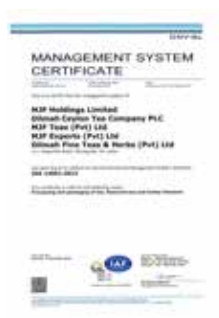
ISO 14001:2015 Environmental Management System Certification