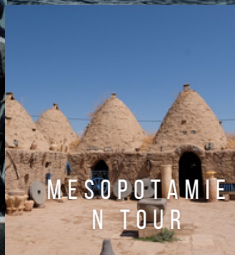
MESOPOTAMIE N TOUR