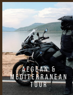
AEGEAN & MEDITERRANEAN TOUR