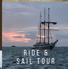
RIDE & SAIL TOUR