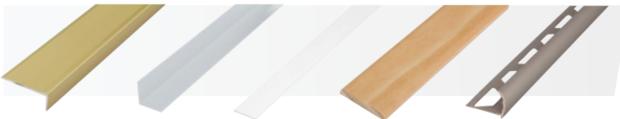
> Aluminium profiles > Cold-rolled steel sections > Hot-rolled steel sections

Simple solutions for hanging curtains and net curtains