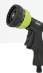
> Watering accessories