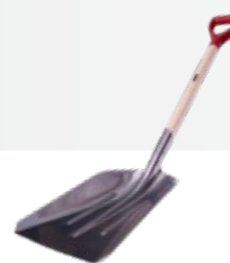
> Garden tools & accessories