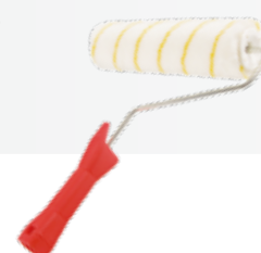
> Painting accessories