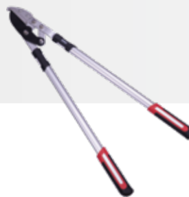
> Pruning shears

Accessories for watering, pruning, garden care and upkeep tools