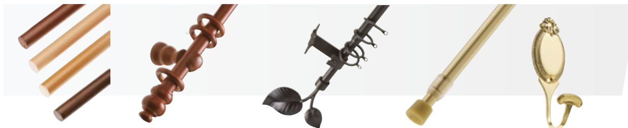
> Wooden poles, rings & supports